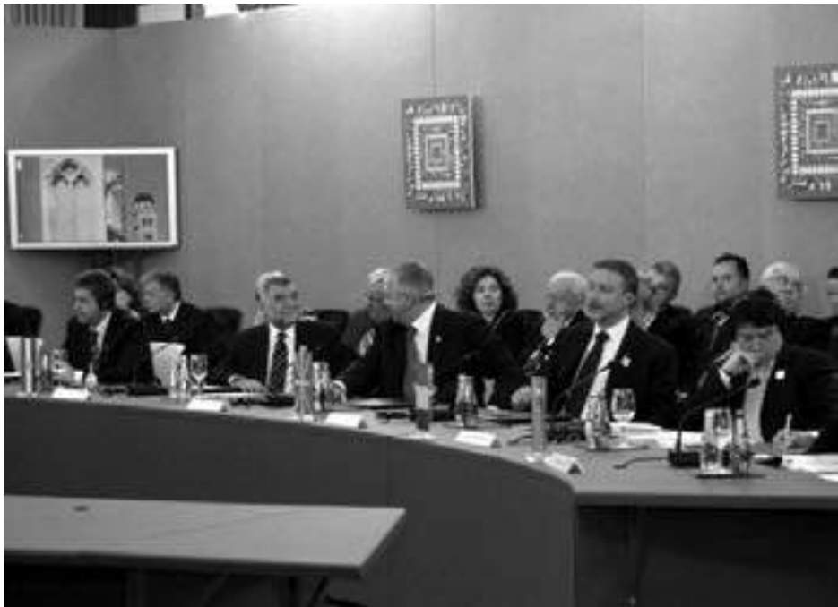
The Opatija Regional Forum on Communication of Heritage