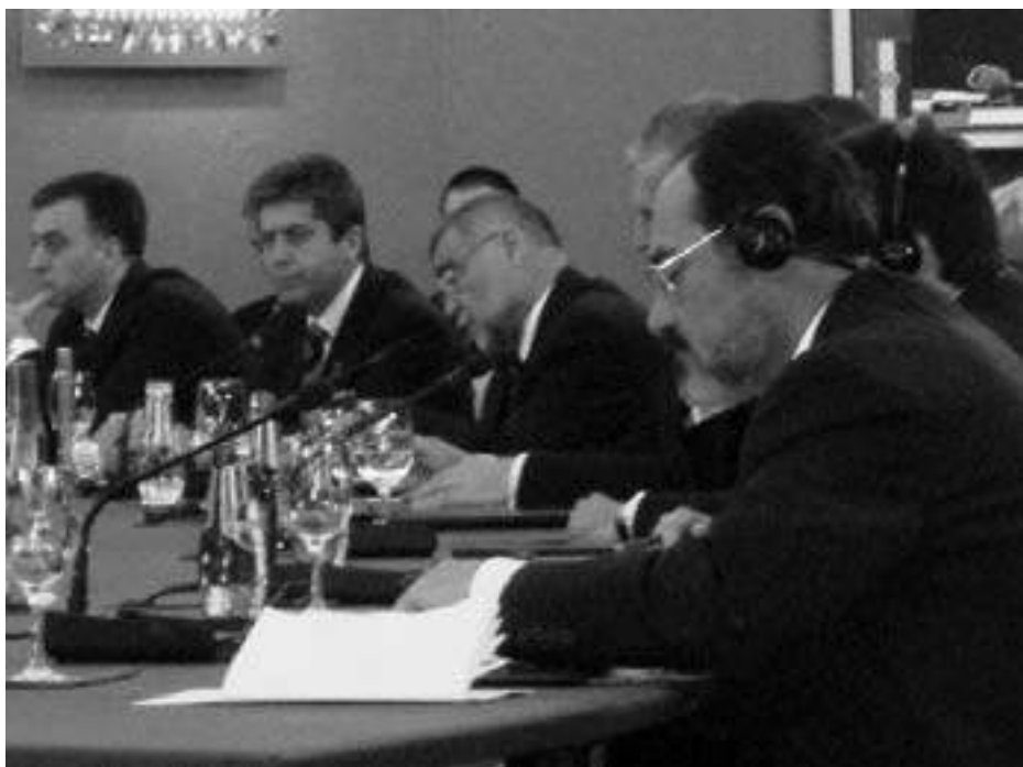
The Heads of State/Government at Opatija Regional Forum on Communication of Heritage