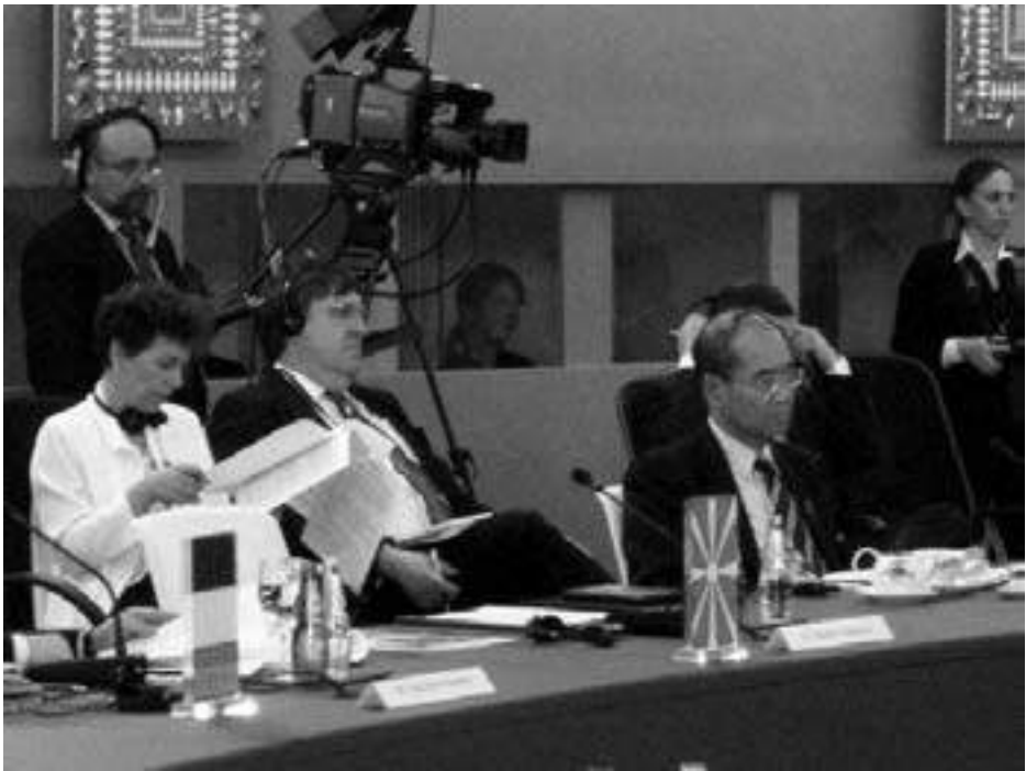
The Opatija Regional Forum on Communication of Heritage