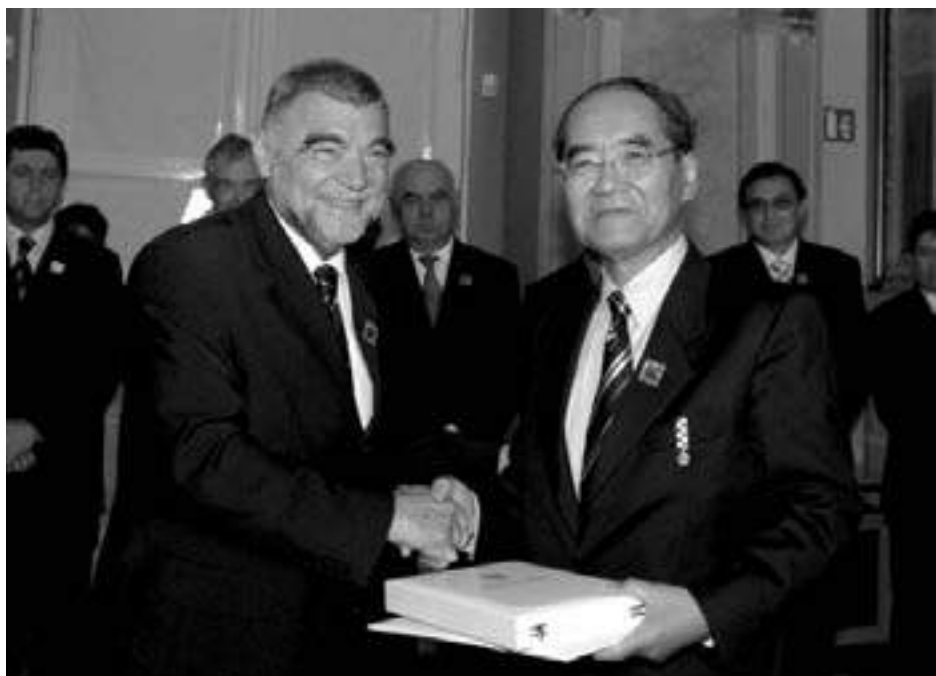
Stjepan Mesić, President of the Republic of Croatia, with Koïchiro Matsuura, Director-General of UNESCO