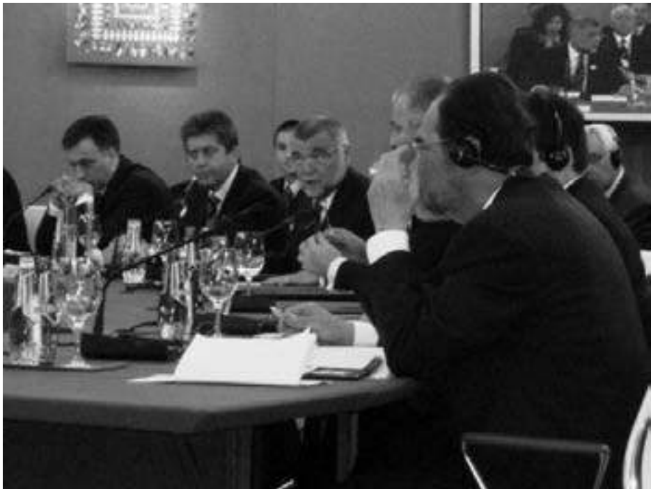
The Heads of State/Government at Opatija Regional Forum on Communication of Heritage