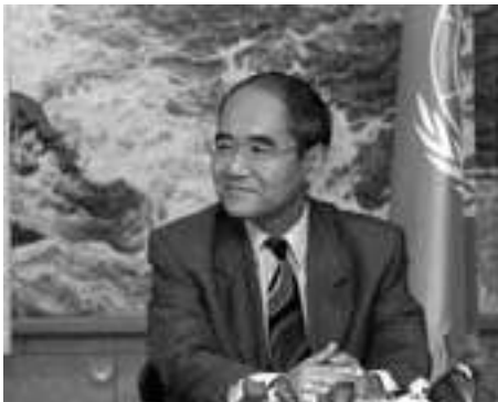
Koïchiro Matsuura Director-General of the United Nations Educational, Scientific and Cultural Organization

Effective and meaningful cooperation requires mutual understanding and genuine dialogue among all parties involved. UNESCO will not be found wanting in helping expand and deepen this process, in an effort to produce tangible results and provide guidance in the further development of policies that will benefit the countries of South East Europe.