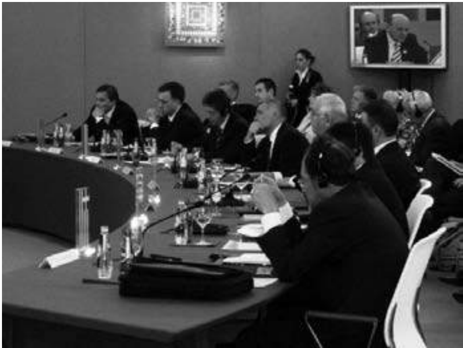
The Heads of State/Government at Opatija Regional Forum on Communication of Heritage